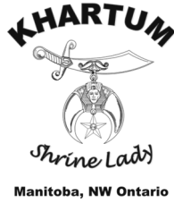
LADIES logo & Sizing Option!