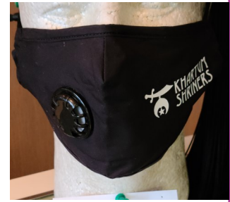
Khartum Shrine Mask $15