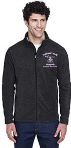
Fleece Jacket $60 S — 5XL Black, Burgundy, Gold, Purple, Navy, Red, Forest, Charcoal, Royal