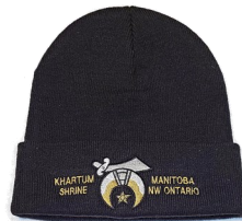
Shrine Toque $30 Gold, Charcoal, Safety Orange, Royal, Burgundy, White, Black, Pink, Red, Safety Green, Navy