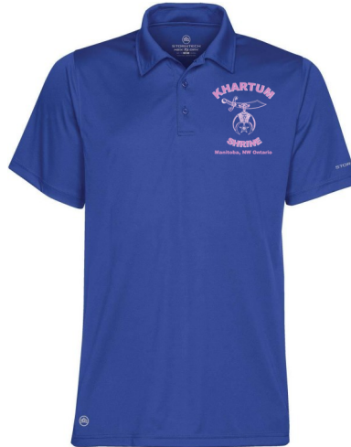
Performance Polo $45 S — 5XL Black, Forest, Graphite, Kelly Green, Lilac, Navy, Orange, Royal, Yellow, White, Scarlet Red LADIES: Black, Graphite, Kelly Green, Navy, Orange, Royal, Scarlet Red, White