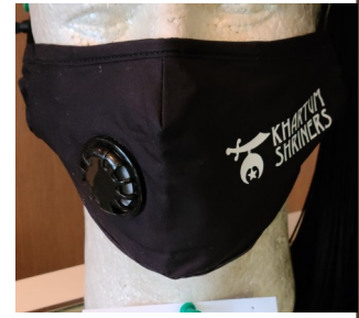
Khartum Shrine Mask $15