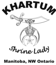
LADIES logo & Sizing Option!