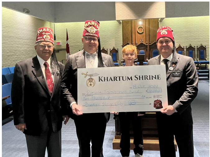
Presentation from the Brandon Shrine Club to the Patient Transportation Fund