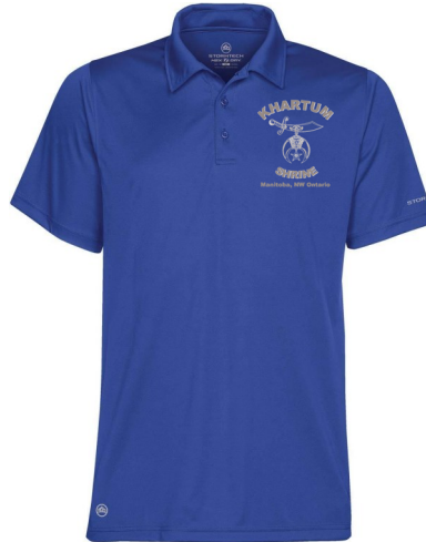
Performance Polo $45 S — 5XL Black, Forest, Graphite, Kelly Green, Lilac, Navy, Orange, Royal, Yellow, White, Scarlet Red LADIES: Black, Graphite, Kelly Green, Navy, Orange, Royal, Scarlet Red, White