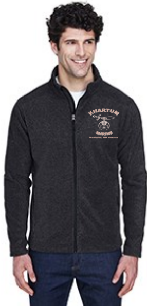
Fleece Jacket $60 S — 5XL Black, Burgundy, Gold, Purple, Navy, Red, Forest, Charcoal, Royal