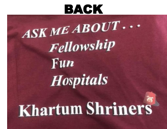
Fez Friday T-Shirt $30 L — 3XL Burgundy