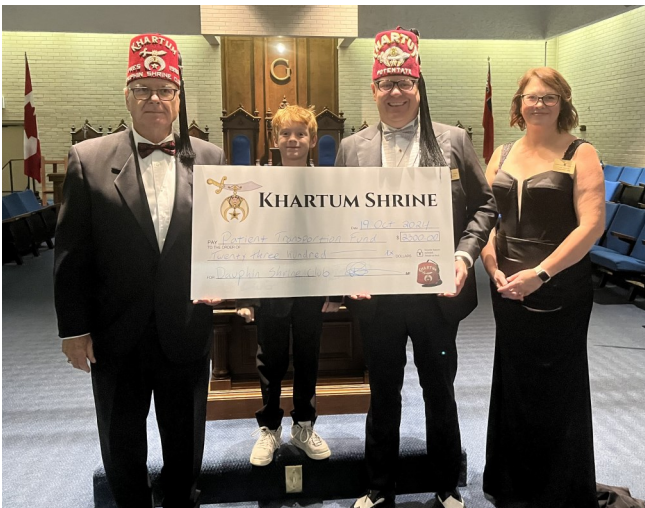
Presentation from the Dauphin Shrine Club to the Patient Transportation Fund