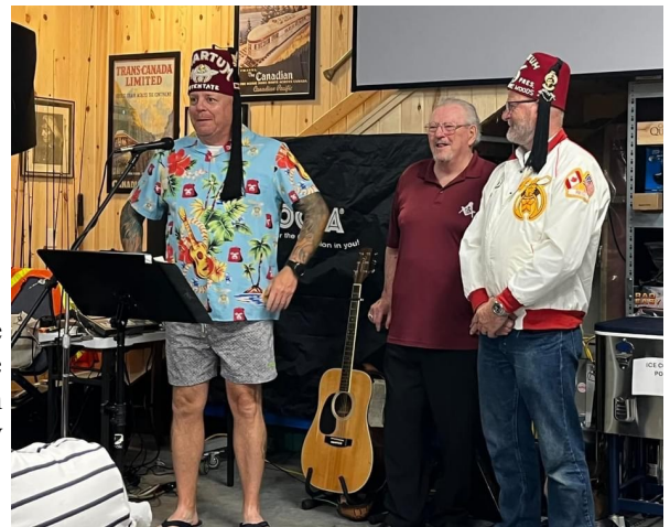
Lake of the Woods Shrine Club's Fish Fry