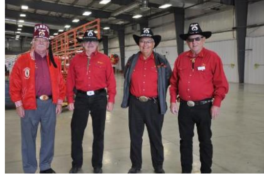
Khartum Kowboys Winnipeg Circus