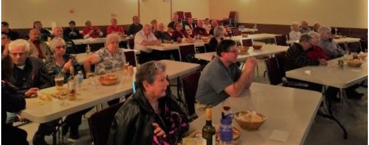
On a wide screen