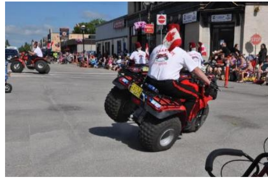
Rough Riders Selkirk Parade