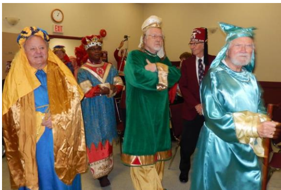
The cast paraded in: