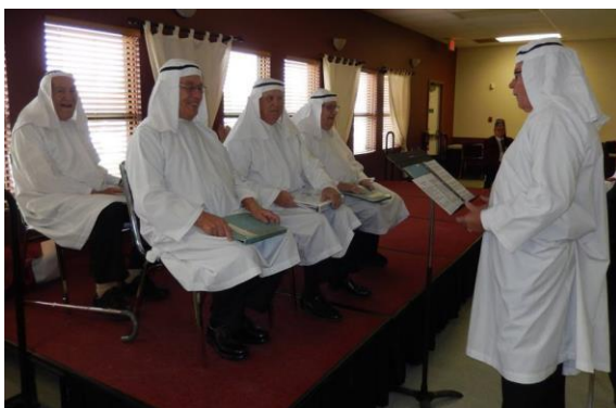
The Chanters provided the required musical accompaniment, and marching songs.