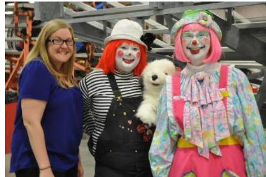
Klassy Klowns Winnipeg Circus