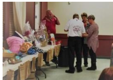
and more winners