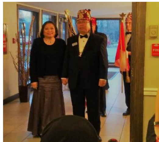
And piped in our Illustrious Potentate and his Lady