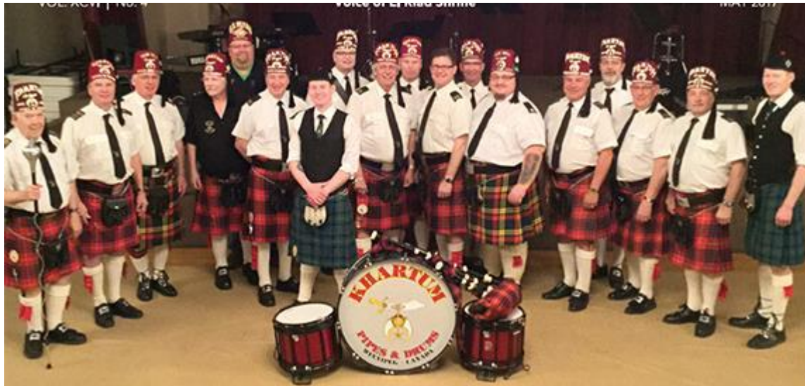
Picture of the Khartum Pipes and Drums as it appeared on the cover of El Riad Cactus (the voice of the El Riad Shrine) for the May 2017 issue.

It has been a year of change and there is more to come. However, in spite of the occasional bickering the brotherhood of the band continues. Please accept my best wishes to you and your family that you will enjoy a Happy Holiday, a Happy Hanukkah, a Merry Christmas and a Happy, Healthy and Prosperous New Year!