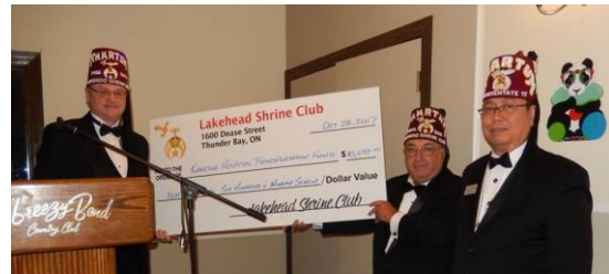
And More Presentations