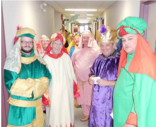
The cast assembled and prepared to enter the hall'