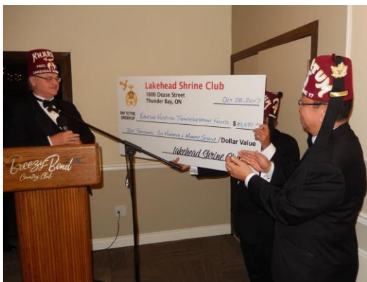
And presentations were made: