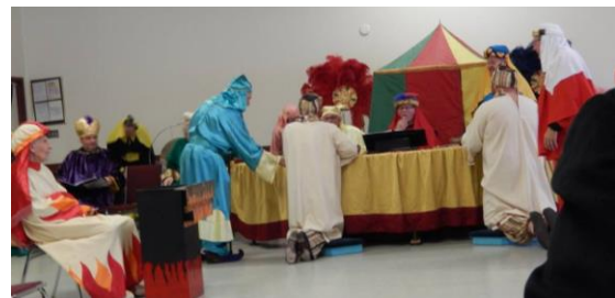
The Candidates are obligated: