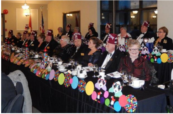
There was an elaborate and extensive Head Table