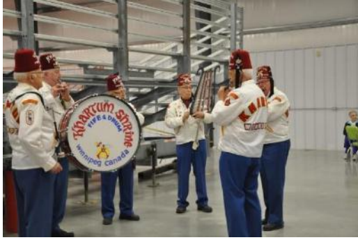
Fife and Drum Winnipeg Circus