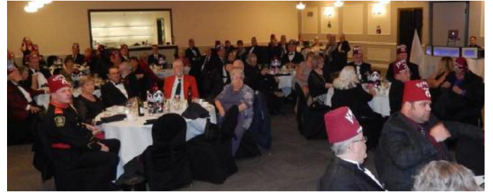
It was a large crowd