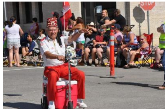
Directors Staff in Selkirk Parade