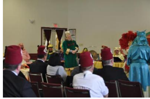
Ritualistic Unit performing at Ceremonial