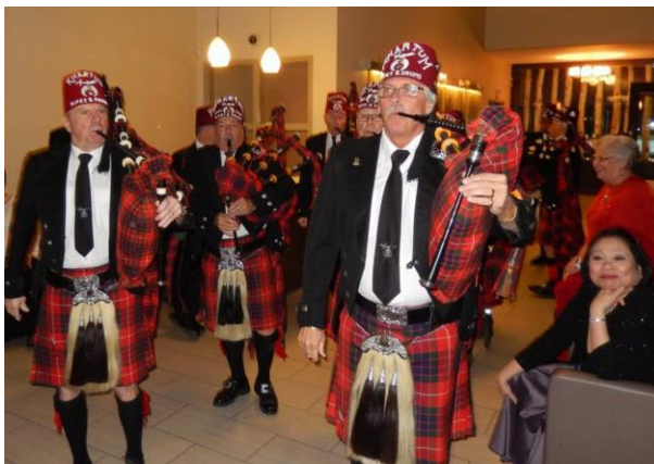
The Pipes and Drums lead in the Head Table