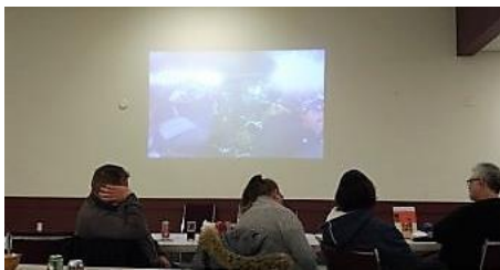
And there were winners