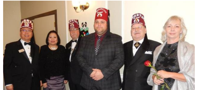
The new Nobles were Fezed